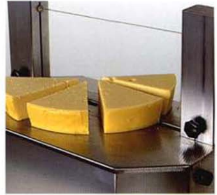
Cutting of consumer pieces