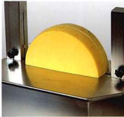
Cutting of half a cheese